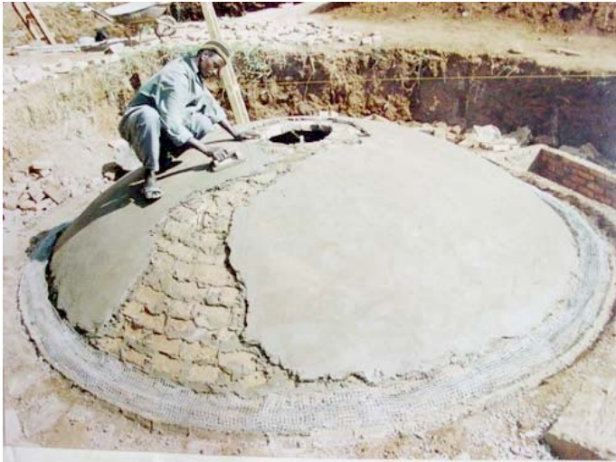
Figure 3: Biogas production for families.

Figure 3 is an example of African indigenous knowledge systems presented in a PowerPoint presentation by Prof. Silas Lwakabamba, Rector of the Kigali Institute of Science, Technology and Management (KIST), Kigali, Rwanda [16].